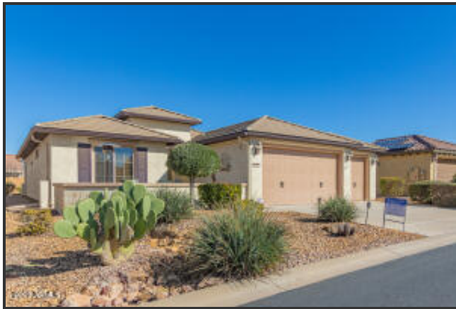
Front furnished Patio w/heater,