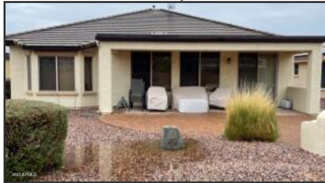
Extended paved back Patio